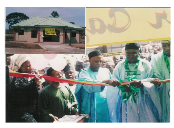
NVRI Cybercafe : Commissioning of IT facility by the Hon. Minister of Agric. and Chief Audu Ogbe (Representative of the President, Fed. Rep. of Nig.) and other Dignitries observing