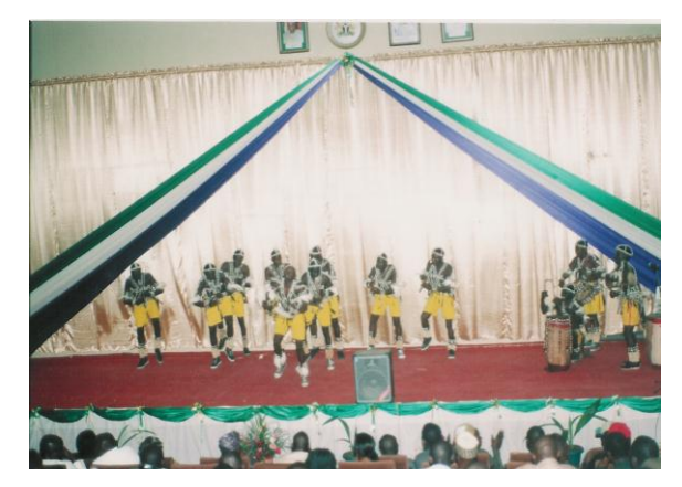
Variety Night: Jarawa Dancers of Plateau State